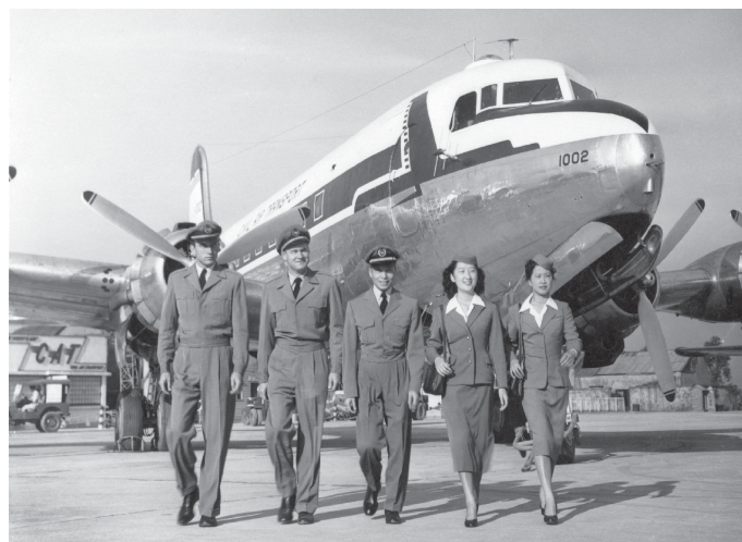
Capt. Hicks and Crew, DC-6B