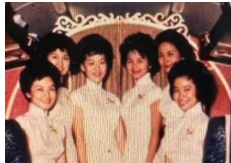
Interior of Convair 880-M; Flight Attendants