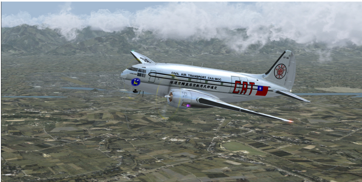
C-46 with Civil Air Transport Civil Aeronautics Administration livery

On January 2, 1948, Chennault and Willauer signed a draft agreement for continued operations of the airline under the control of the Ministry of Communications – confirmed by the final contract on May 28, 1948. The authorized name of this partnership became: “Civil Air Transport of the Civil Aeronautics Administration, Ministry of Communications.” CAT’s aircraft would temporarily show this CAT - Civil Aeronautics Administration livery. The partnership was a strategic and legal move to allow CAT, as American-owned, to operate during the Civil War.