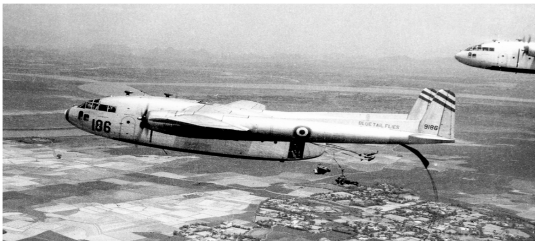
Parachutists Exiting C-119

CAT pilots were given accelerated orientation and flying instructions for C-119s at Clark Air Force Base and then moved on to Cat Bi Airfield, Haiphong. The airdrop of supplies and parachutists at Dien Bien Phu began in March 1954. It was a three-hour round trip for three minutes over the target with little or no air cover by the French Air Force.