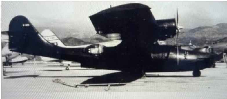
Western Enterprises, Inc. PBY-5A