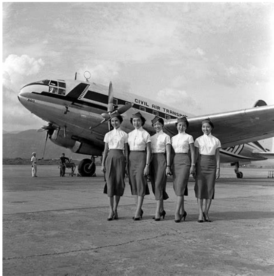
C-46 with Flight Attendants

CAT's designation as Asia's Airline of Distinction evolved from C-46 passenger service to four-engine DC-4 flights, followed by the Mandarin Flight DC-6B service, and the Mandarin Jet. Regular scheduled DC-4 flights from Hong Kong – Taipei – Tokyo began in September 1952. Mandarin Flight DC-6B service began in October 1958. The last DC-4 international flight was in July 1961; it was then used for round-the-island flights.