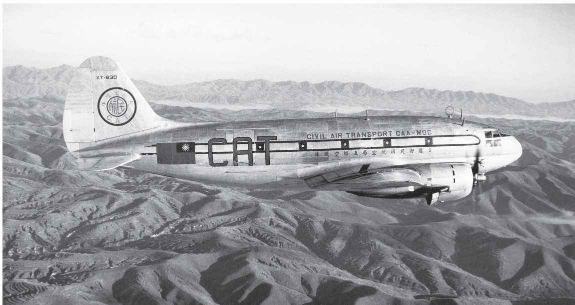
CAT C-46 in-flight

Cargo-carrying C-46 and C-47 aircraft were the mainstay aircraft for airlift missions. In late 1948, CAT started weekly flights to parts of China in cargo configuration. In March 1949, scheduled flights began from Kunming – Haiphong – Chungking and from Canton to the China interior.