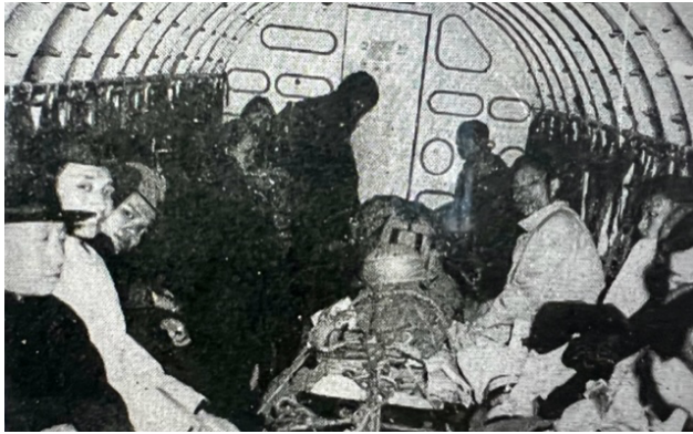
C-47 Cargo & Passengers

Passengers initially were seated in bucket seats along the sides of the aircraft with cargo lashed in the center aisle. As routes developed, these cargo-configured aircraft transformed into plush passenger configurations. In June 1949, C46 XT 810 was pushed-up for passenger service.