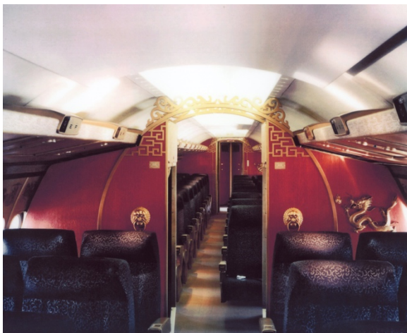
Interior of Convair 880-M