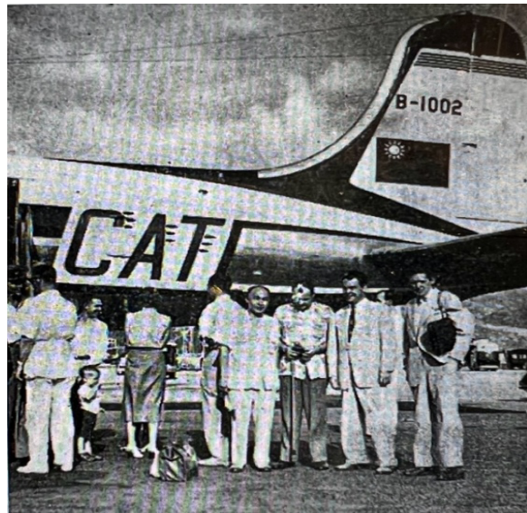
DC-4 Inaugural Flight at Hong Kong