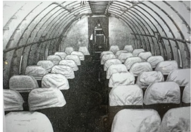
C-46 Pushed-Up for Passenger