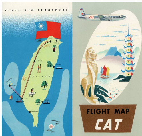
1950 Route Map, Taiwan

In June 1950, CAT initiated four times a week “round the island” flights in Taiwan with C-47 aircraft: Taipei – Hualien – Taichung – Tainan – Makung. Revenues from the Korean