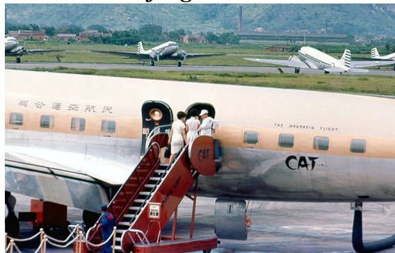
Flight Attendants Boarding DC-6B

I was only three years old when I took my first trip to Hong Kong, and I hardly remember any details of the trip. The second trip I made with my mother and kid brother on the DC-6B Mandarin carrier from Taipei to Hong Kong in the summer of 1966 was unforgettable .