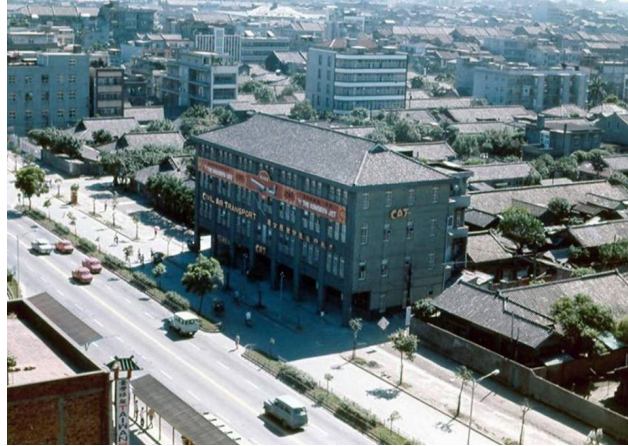
CAT Headquarters Building, Taipei