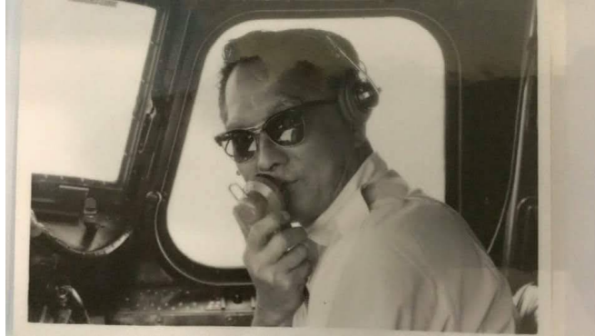
My Father at the right seat of DC-6B

Chinese coastline (this was 1966 and the two sides of the Taiwan Strait were seriously at war!). Years later when I needed to fly to Hong Kong for business, I always asked for seats on the right side of the plane, hoping to re-capture the sight of Shantou and the image with my dad in his DC-6B cockpit.