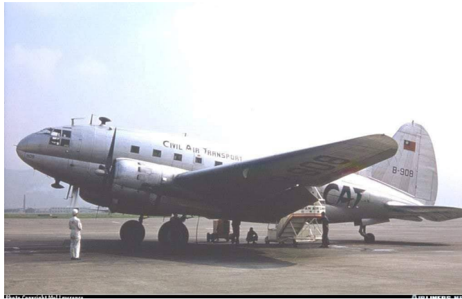
C-46 B-908 that crashed on Jun. 20, 1964

hijackers, the fate of my family would have been entirely different and I would not be able to write this article now.